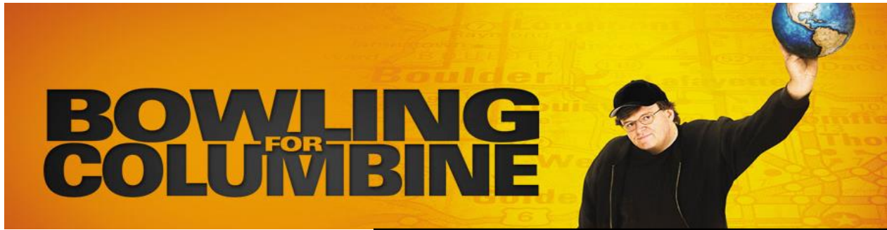
A documentary by Michael Moore (2002)