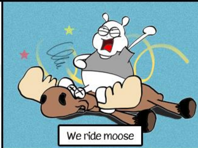
We ride moose