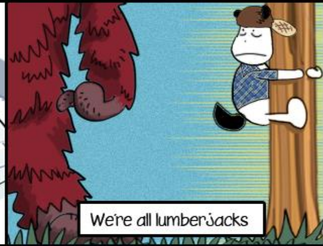
We're all lumberjacks