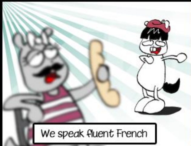
We speak fluent French