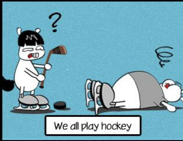
We all play hockey