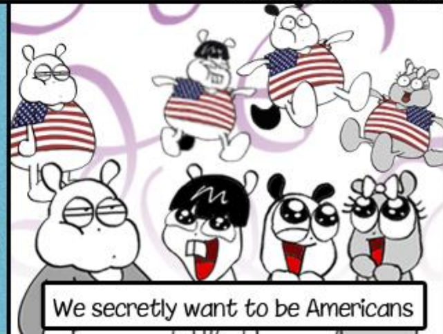
We secretly want to be Americans