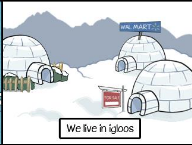
We live in igloos