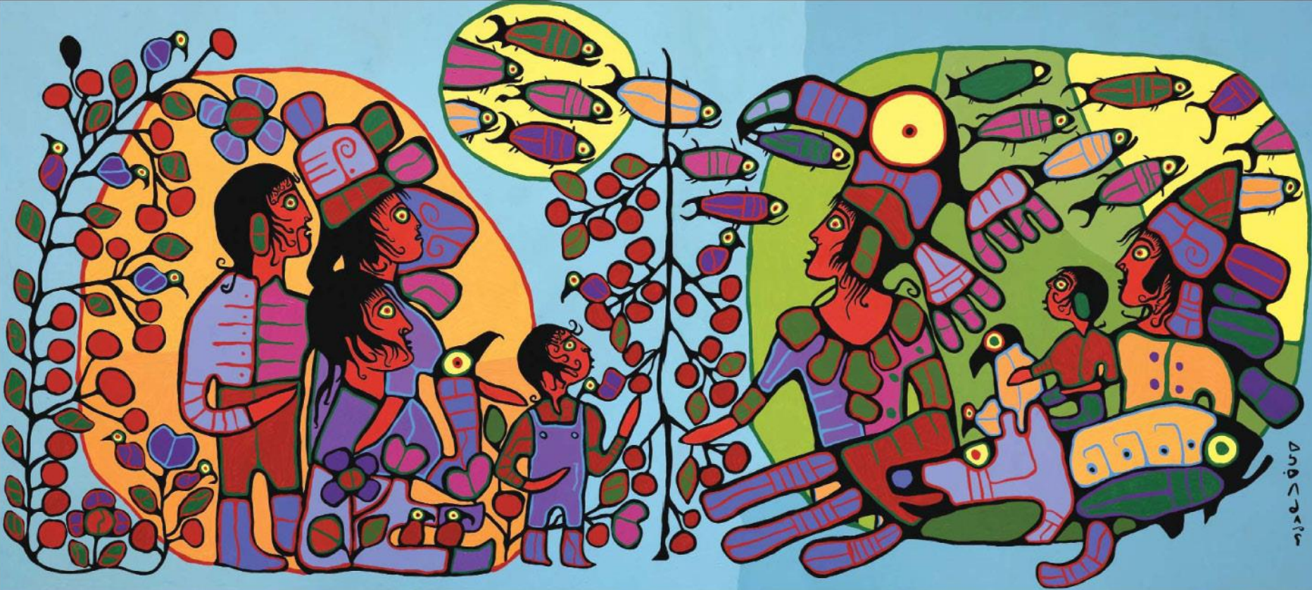
Keepers of Life, Norval Morrisseau