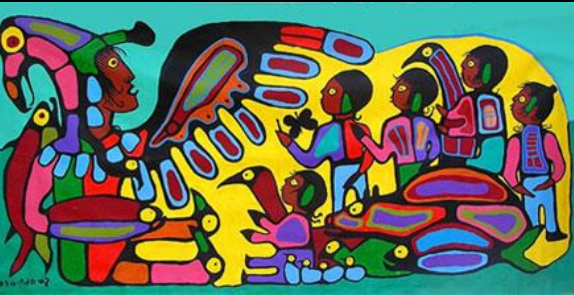
Nature Story, Norval Morrisseau