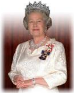
Her Majesty Queen Elizabeth II Sovereign