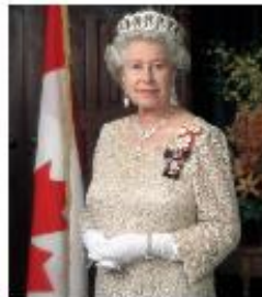
Her Majesty Queen Elizabeth II Sovereign