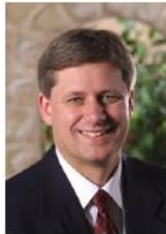
The Right Honourable Stephen Harper Prime Minister