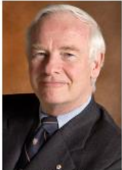
His Excellency The Right Honourable David Johnston Governor General