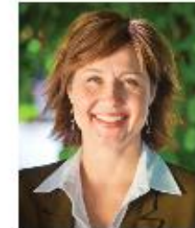
The Honourable Christy Clark Premier