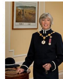
The Honourable Judith Guichon Lieutenant Governor