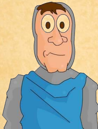
William of Normandy